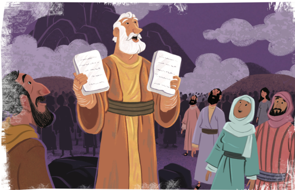
The Ten Commandments (Exodus 19-20) • Unit 5, Session 3 • © 2011 LifeWay OLC to Press

It's just like when our parents give us rules to protect us: to look both ways before we cross the street, to not hit our brother or sister... They give us rules because they love us and know what's best for us.