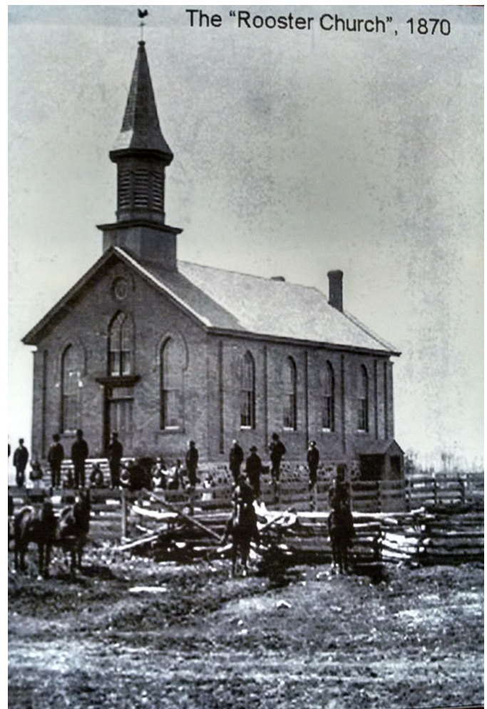
The "Rooster Church", 1870