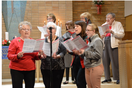
The choir added their angelic voices to the service.